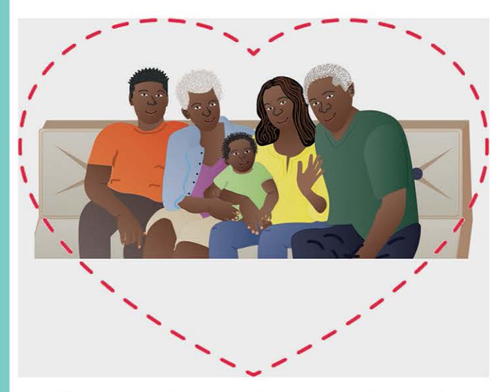
If you need help or feel overwhelmed, talk with your healthcare provider to create a plan that is best for you and your baby .

Lots of people love your baby. Strongly encourage everyone who helps you take care of your baby to have your baby's back by practicing safe sleep.