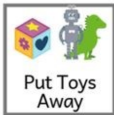
Put Toys Away