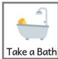
Take a Bath