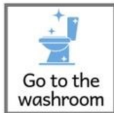
Go to the washroom