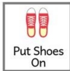
Put Shoes On