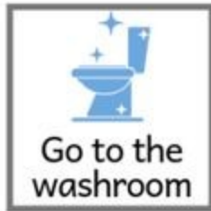
Go to the washroom