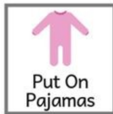
Put On Pajamas